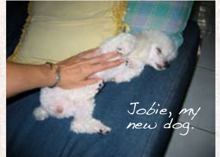
Jobie, my new dog.