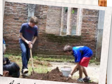
A couple of our students leveling the ground for a play area in my neighborhood.

My long-time roommate (who was forced to leave the country last June due to new work permit regulations) was allowed back! We don't know what changed, but we know that God was at work!