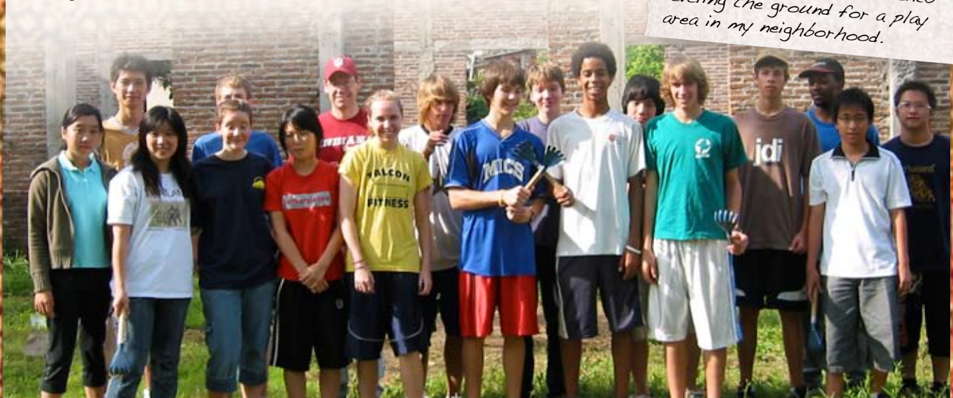
Our work crew (neighborhood play area work) at the beginning of service day. They were much dirtier at the end!